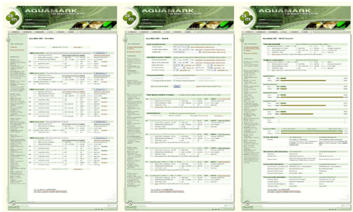
The 3 ARC steps: overview, search, compare